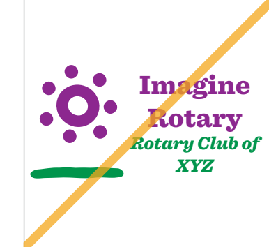
Don't alter or add copy to the logo. Don't change the fonts.